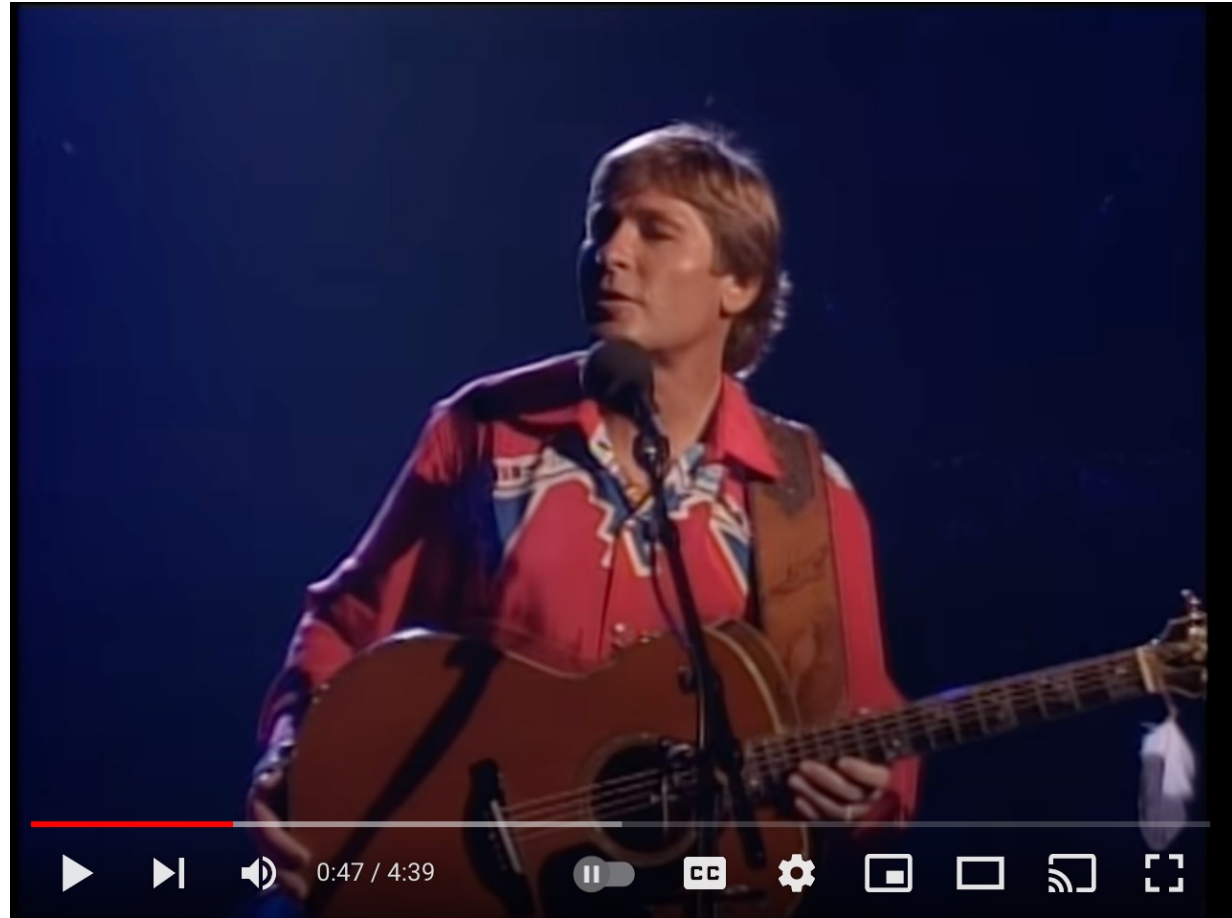
"I Want to Live" by John Denver