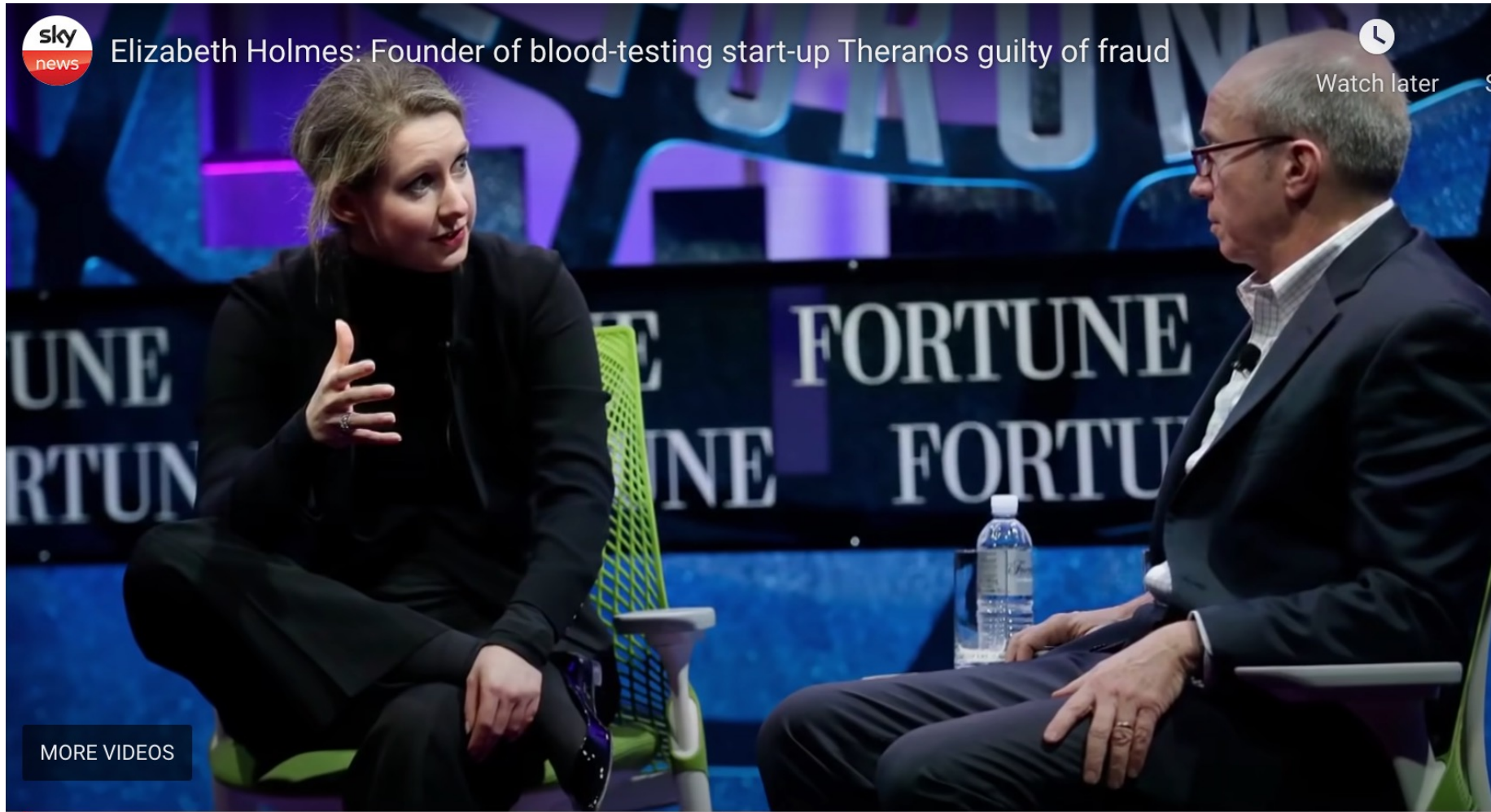
Elizabeth Holmes: Founder of blood-testing startup Theranos guilty of fraud