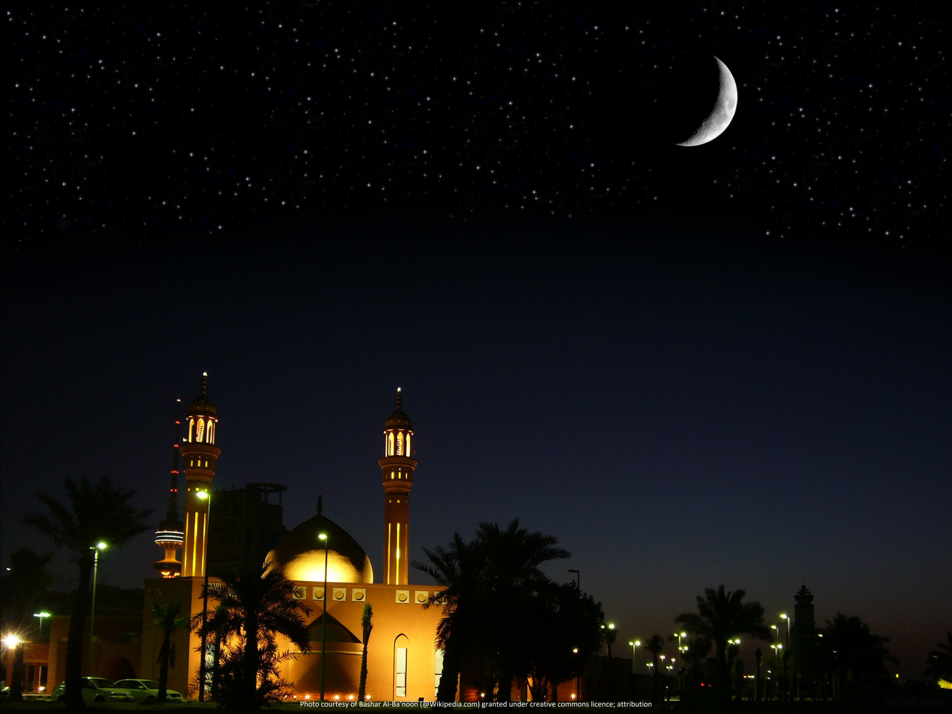
Photo courtesy of Bashar Al-Ba'noon (@Wikipedia.com) granted under creative commons licence; attribution