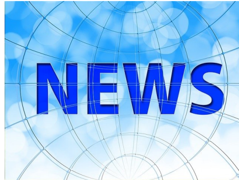
American media uses idioms –a lot!